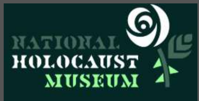
Year 6 trip to the National Holocaust Museum