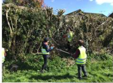
Year 2- looking after our community!