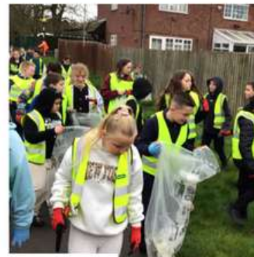
Year 5 - looking after our community!