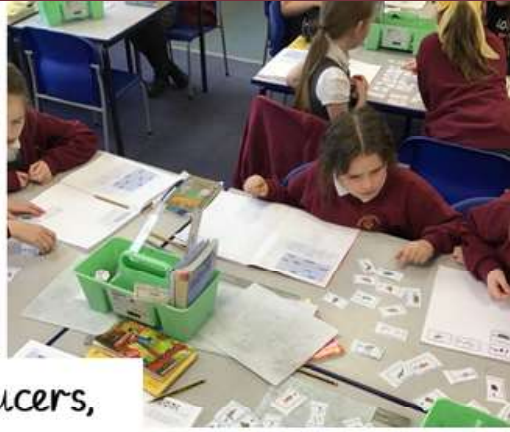
Year 4 Science – identifying producers, predators and prey in food chains